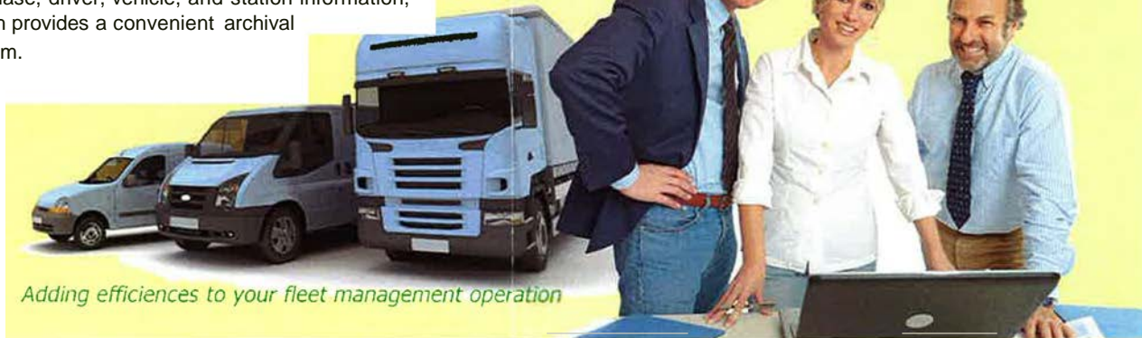
Adding efficiencies to your fleet management operation

Utilizing Google, this robust search function pinpoints the lowest-priced fuel in your area.